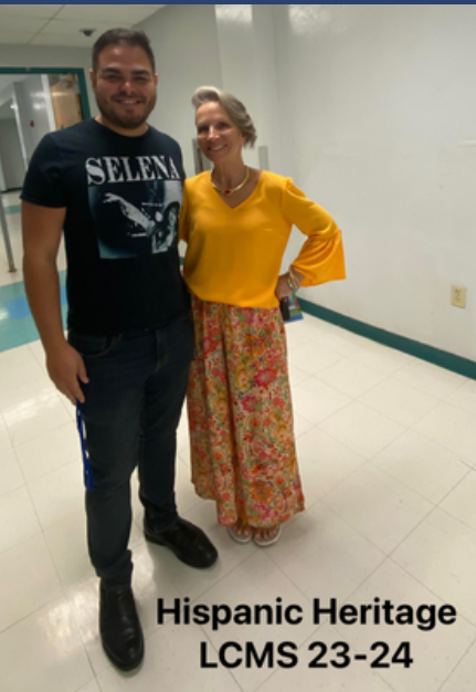
Hispanic Heritage LCMS 23-24